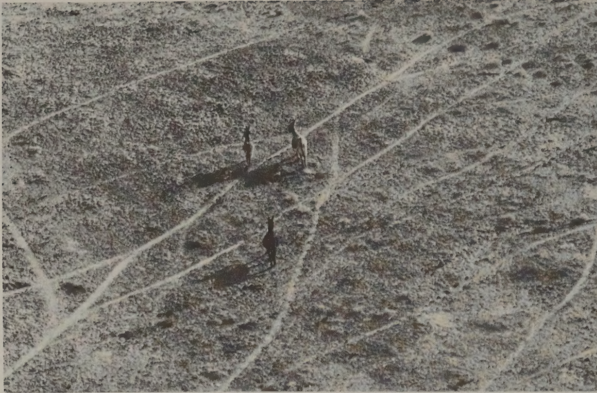
Paths used repeatedly by burros cause erosion and irreparable damage to fragile public lands.

to modify the Act, although it has been amended twice. One amendment, passed in 1976, allowed the Federal Government to use helicopters in managing wild horses and burros. Another, in 1978, required a research program and, in recognition of the existence of excess animals as a growing problem, established the order and priority for their disposition.